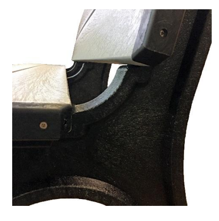
Step 2 - Check that the seat length is resting flat against the horizontal (seat) edge of the leg and snug against the back stop of the leg. See photo above.