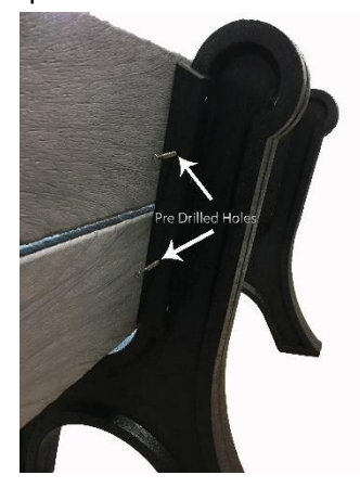
Step 5 - Screw 4-4^{\prime\prime} Coated Steel Screws into each leg using the pre-drilled holes through the 2" x 2" runners. See photo above.

Step 4 - Place the back length against the vertical (back) edge of the legs and make sure the back rests snug against the leg and the bottom stop of the leg. See photo from Step 2.