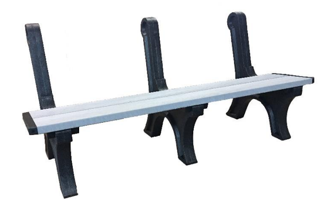
Step 1 - Stand up the three bench legs and place the seat length on top of the horizontal (seat) edge of the legs. Make sure the legs are between the 2" x 2" runners on the bottom of the seat. See photo above.

Build the bench on a flat or level surface.