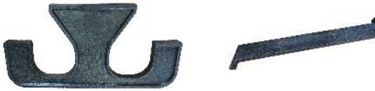
Walk Thru Legs (3)