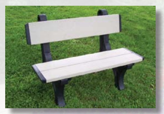
4' Standard | 48"W x 28½"D x 33½"H Park Bench | 95 Lbs.