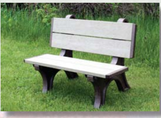
4' Deluxe 48"W x 28½"D x 33½"H 110 Lbs. Park Bench

4' Backless | 48"W x 20"D x 17"H 19 Lbs. Park Bench